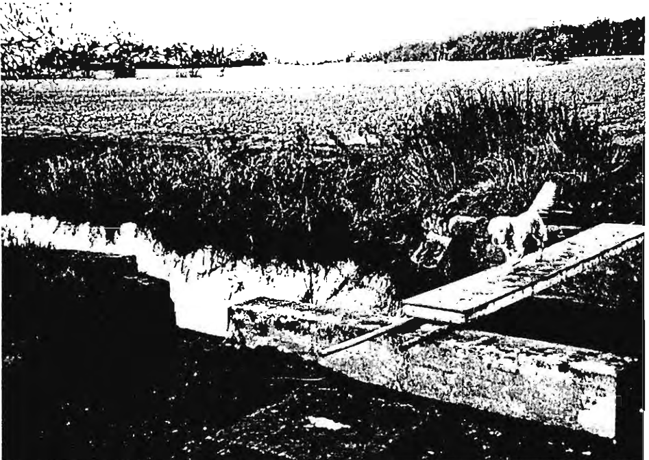
Remains of No 8 Swingbridge showing original foundations November 1993