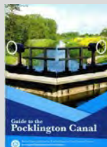
Canal Guide £5