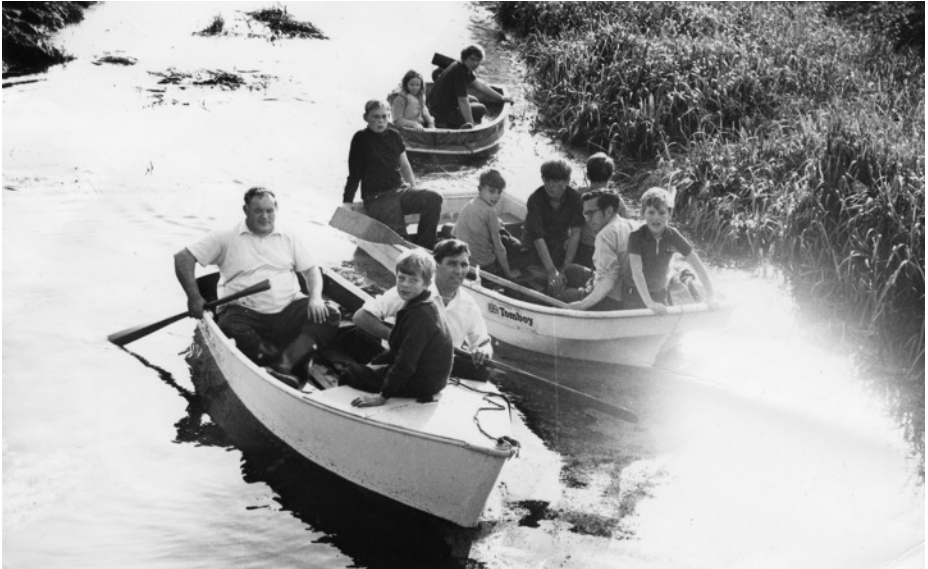
Above: During the 1970's PCAS held several canoe and dinghy cruises along the canal. This undated photograph was taken by the Hull Daily Mail.