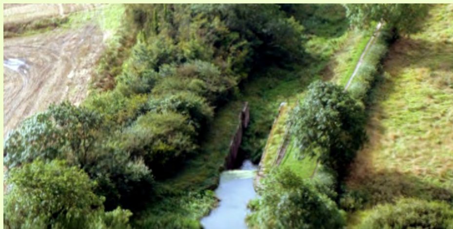
Above: Silburn lock from the air, taken on the 17th August 2019.