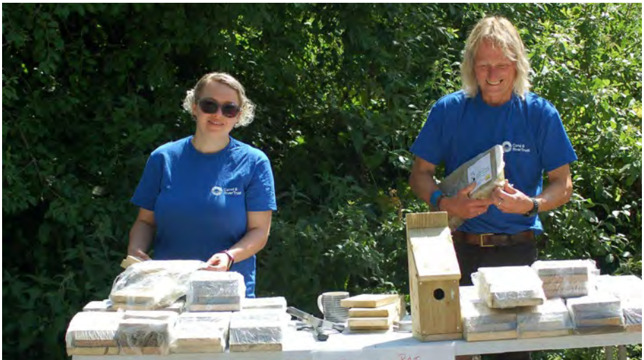
Below: CRT staff making bird & bat boxes for sale at a PCAS Summer event in 2018.