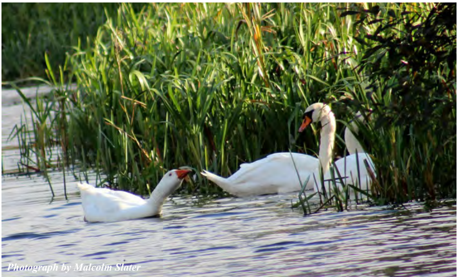
Photograph by Malcolm Slater