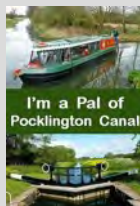
Fridge Magnets £3