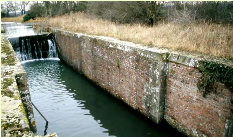
Below: The lock as seen in 1999.